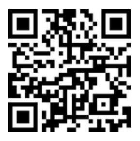
REGISTER AT tinyurl.com/taas-24-mar16